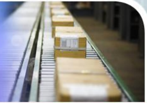
Q1 2017 Sales Rev.