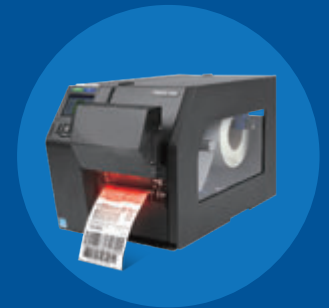
Barcode Inspection Printers