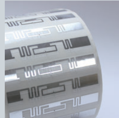
UHF RFID Labels