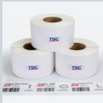
Inkjet Labels and Tanks