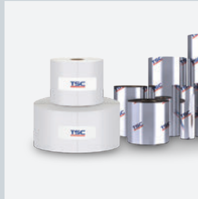
Thermal Printing Solutions