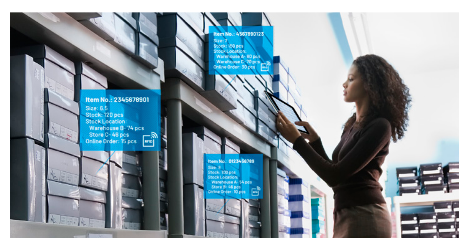
Figure 2: RFID provides a real-time, 360-degree view of product inventory across multiple fulfillment network nodes, reducing the risk of stockouts and overstock

Reduce human error and effort: For omnichannel retail, whether retailers choose to fulfill orders from the warehouse or in-store inventory, confirming order accuracy is required. RFID-tagged merchandise facilitates inspection speed, and the same benefit applies to reverse logistics during return processing. On average, RFID improves labor productivity associated with order accuracy by 96%. <sup>10</sup>